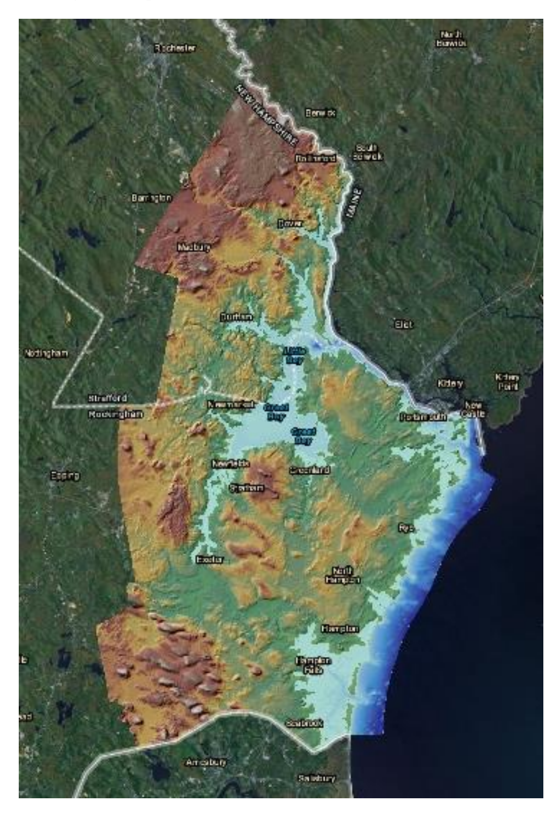
Figure 1. Coverage Area Map