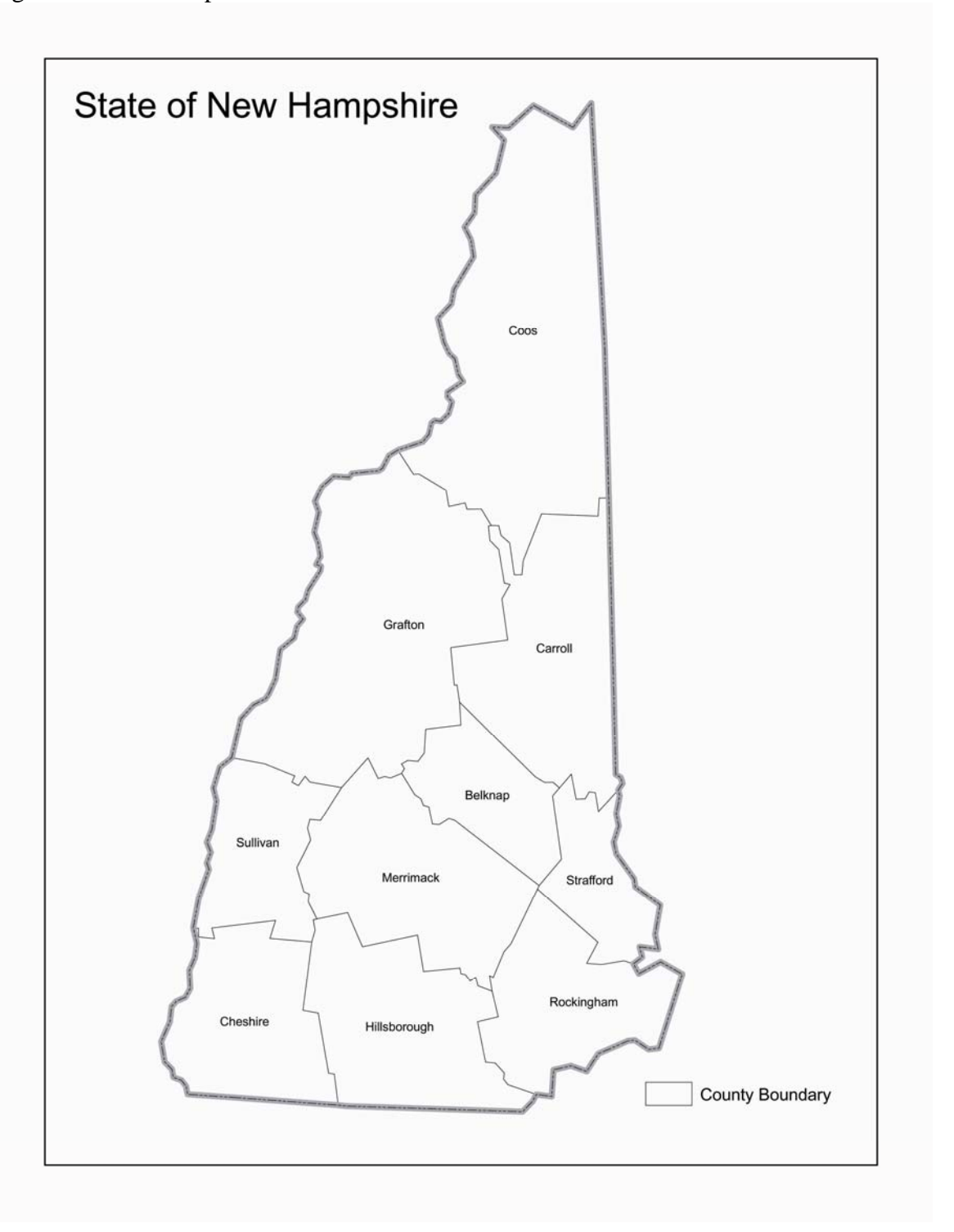
Figure 1. New Hampshire counties.